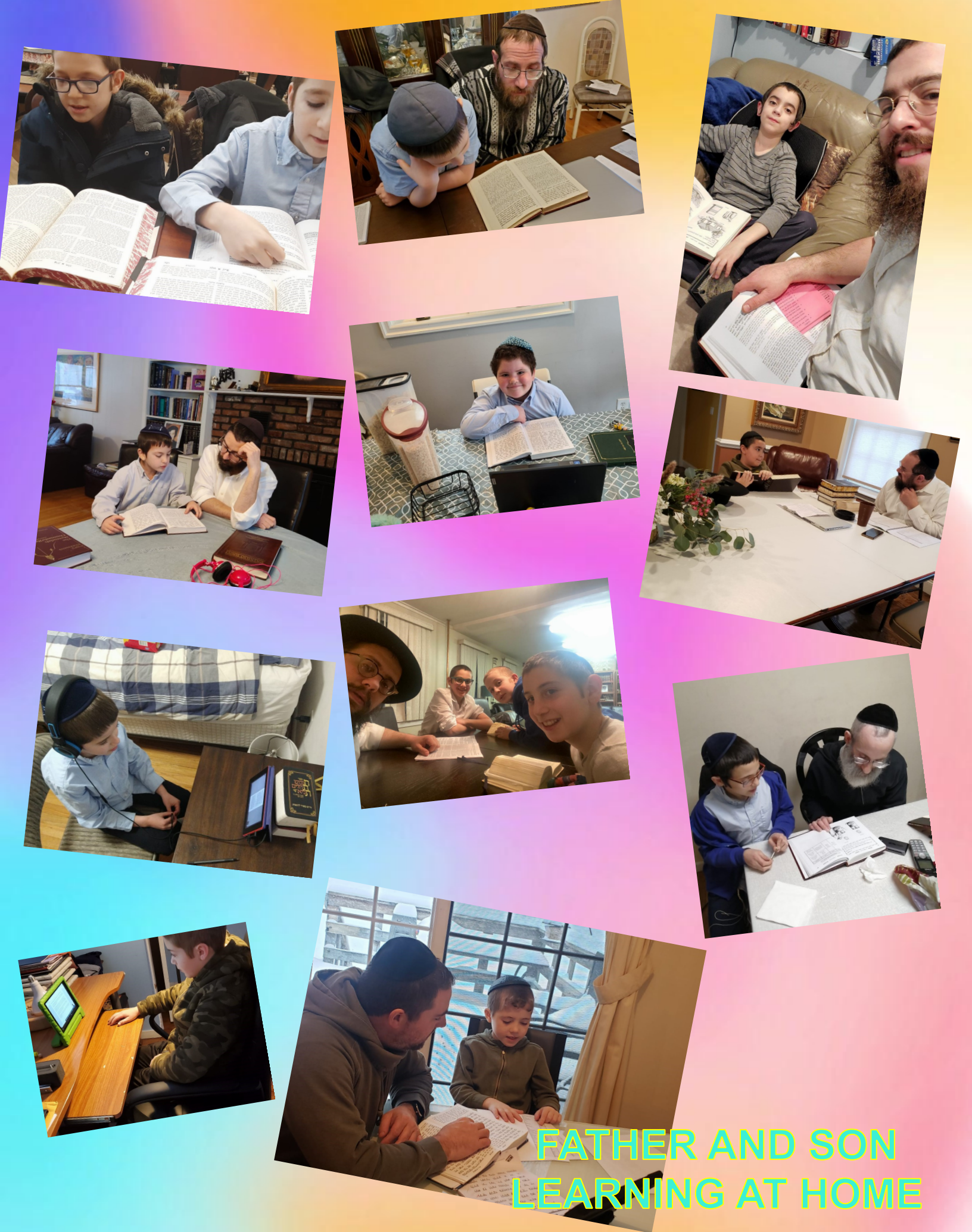
FATHER AND SON LEARNING AT HOME