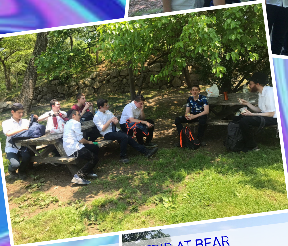
8TH GRADE TRIP AT BEAR MOUNTAIN PARK