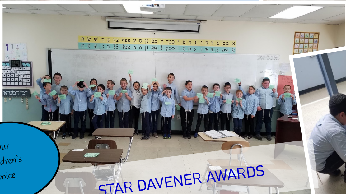
STAR DAVENER AWARDS