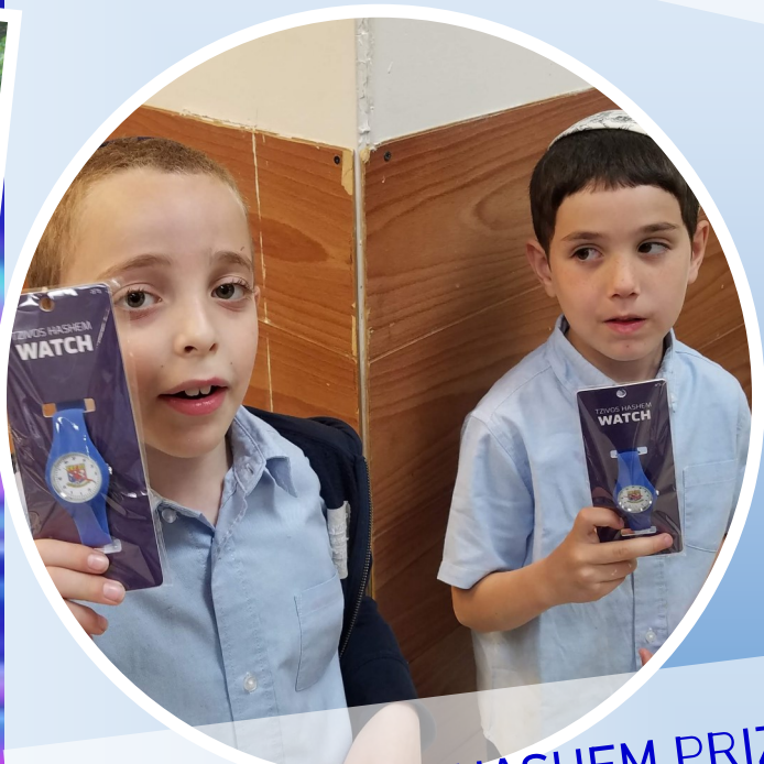
TZIVOS HASHEM PRIZES