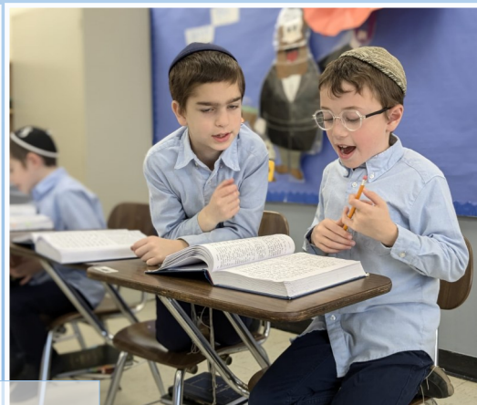
GRADE 4A ART